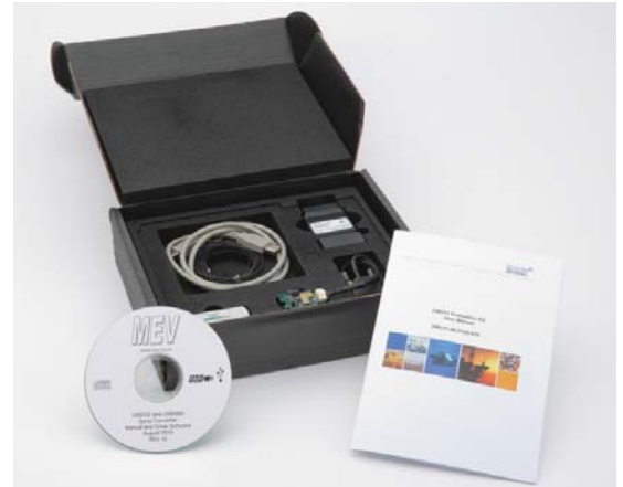
DMU11 EVK Evaluation Kit (P/N DMU11-21-0500)